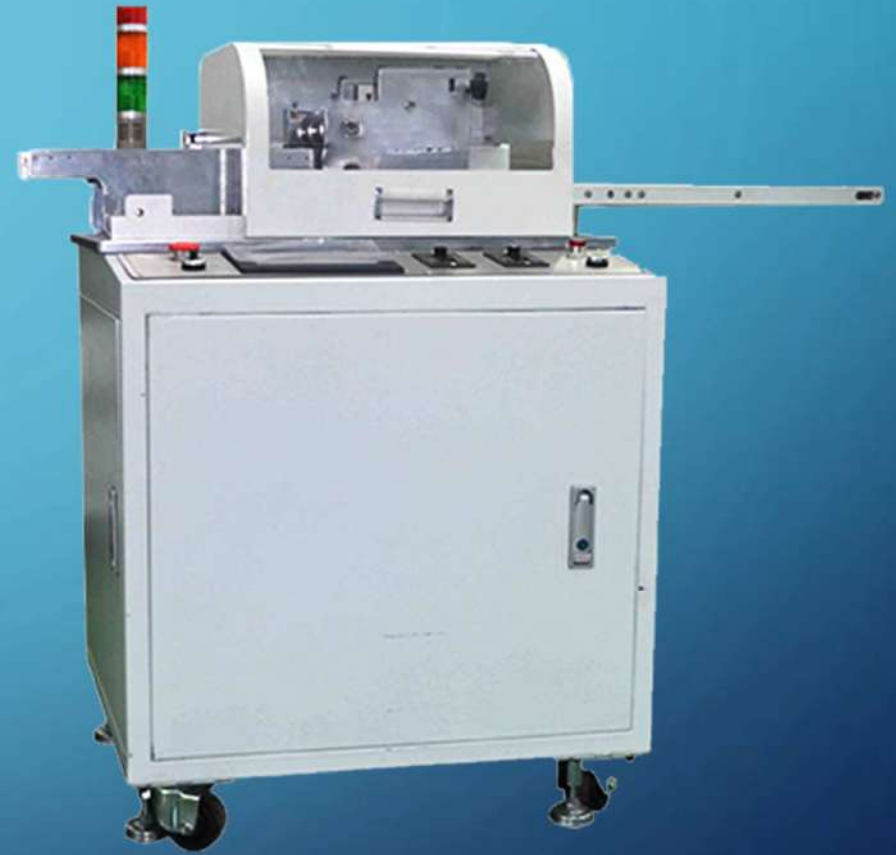
PCB SMT Cutter