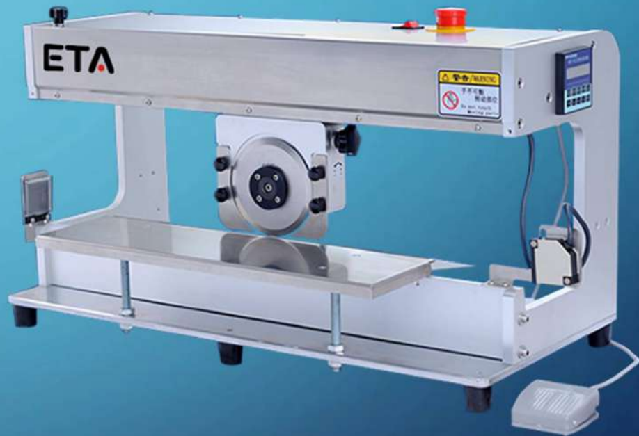
SMT PCB Cutting machine