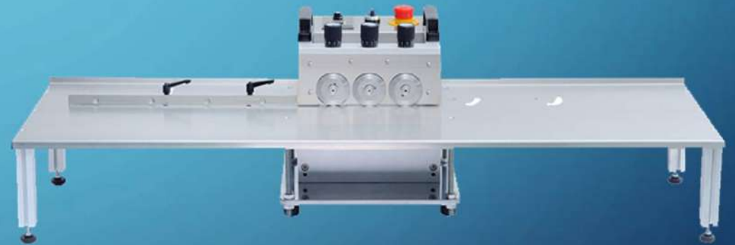
LED PCB V-Cut