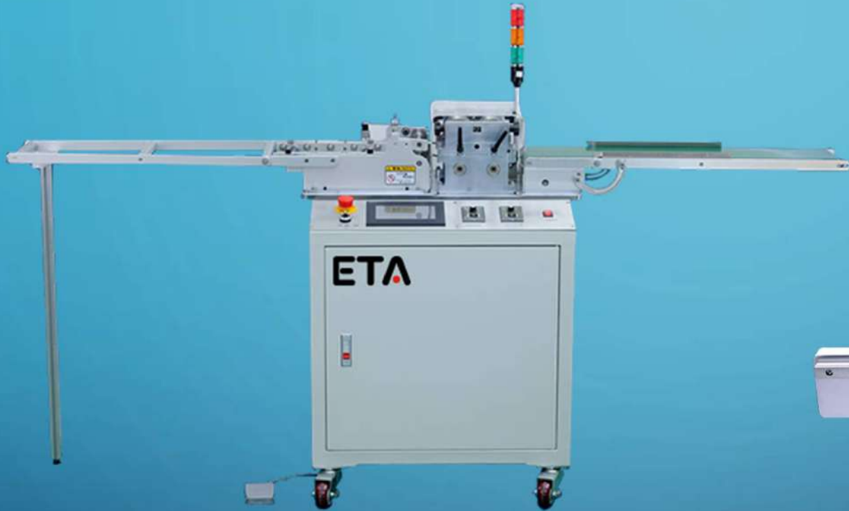
PCB V Cutter