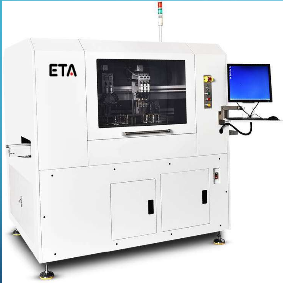
Online Pcba Cutting Machine