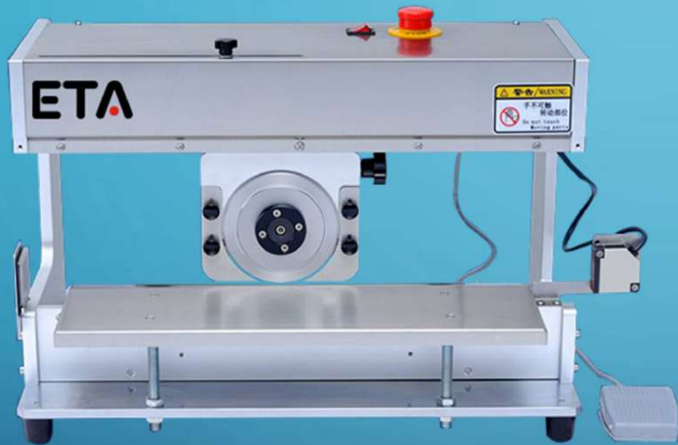
SMT Cutting machine