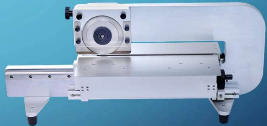
PCB V Cut